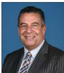
Bruce Pearl Head Coach